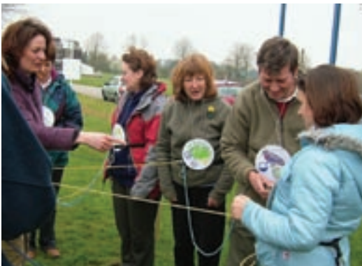
Farm Food Web