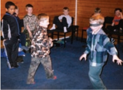
Birds of Prey