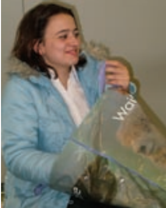
Guess the Veg!