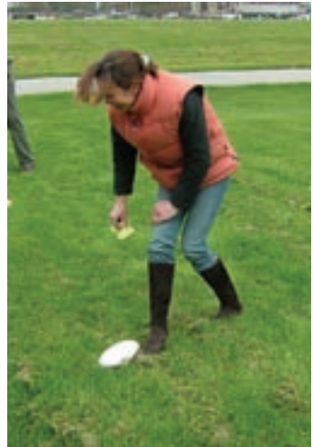
Feed the Animals A