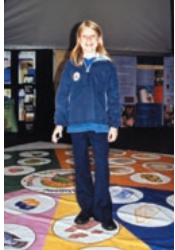
The Good Health Game