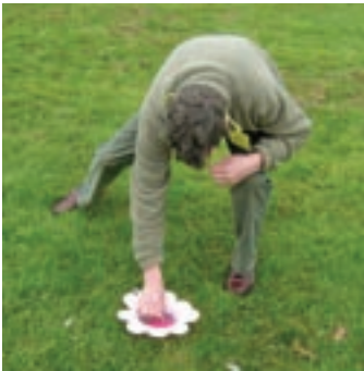
Insect Pollination Game