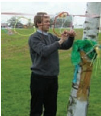
The Photosynthesis Tree